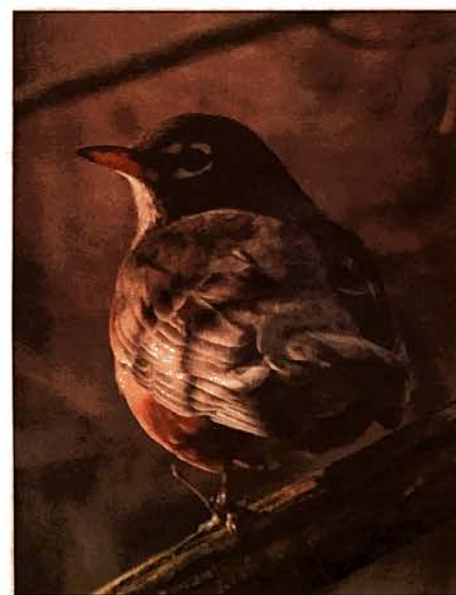
American robin (illustration by Polyphony Bruna)

with power and the indifference of a thing like a mountain or a meteor shower. More like falling in awe than in love.