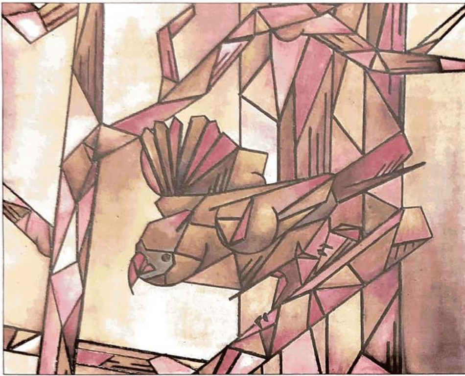
Northern cardinal

of red and, as far as I know, whatever else you've got, that vest is the best. Who's got the best vest? You do! Who looks like a red pupil in the white eye of winter? You do! Who questions the world with feathers? Who could sit on my head like a flaming fist?